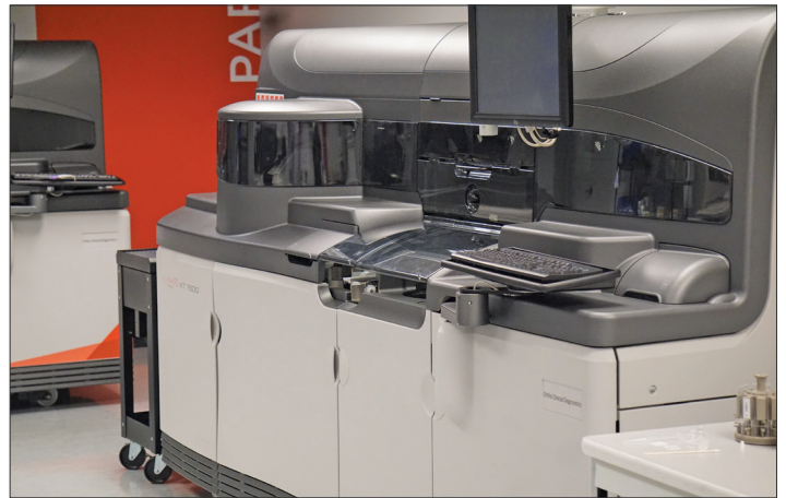
A VITROS XT 7600 machine.